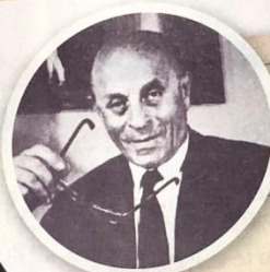
▲ 原子筆的發明人 László Bíró

Eventually, mass production made plastic ballpoint pens more affordable, 3 and soon they were a household 3 staple. 4 Although ballpoint pens were convenient, they changed the way that people write. Because of the way the ink flows, it doesn't feel natural to join letters together. In addition, ballpoint pens can be less comfortable to write with because more pressure must be applied